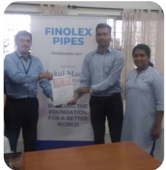
AGREEMENT SIGNING BETWEEN NAWALE TEAM AND MUKUL MADHAV FOUNDATION TEAM.

On 13th April 2023 we have renewed the agreement to make this collaboration strong and provide better therapy services to Children with Cerebral Palsy.