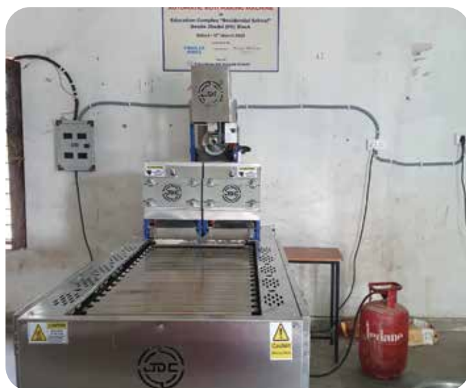
ROTI MAKING MACHINE SUPPORTED TO RBKS.