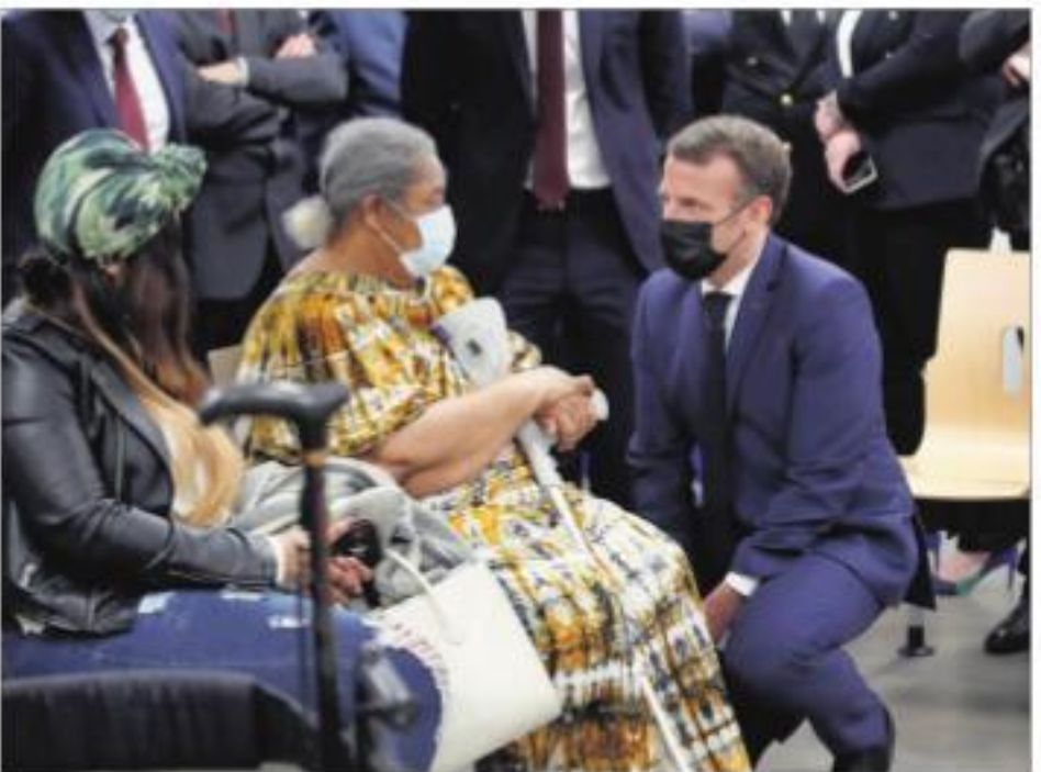
French President Emmanuel Macron talks to a patient in Paris.

variant are in Scotland and two in southwest England. The sixth individual has not been identified because they did not correctly fill in a form with their contact details. Public Health England said it was working to find the person and was conducting local mass testing to see whether the variant had spread in the community. — AP