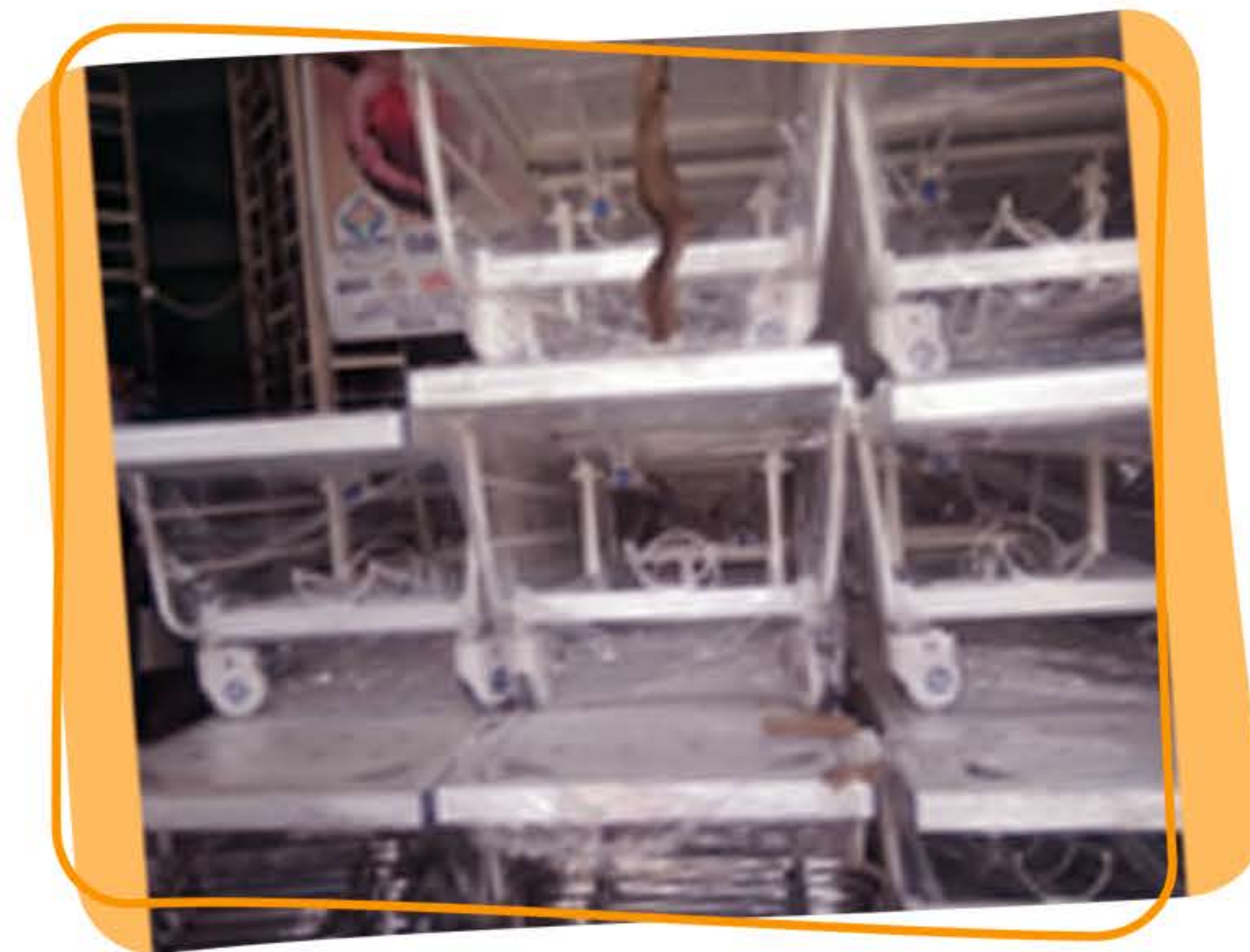
Fowler trolley beds donated to Sassoon General Hospital, Pune

FIL/MMF in its mission to upgrade and provide good facilities to the Government hospitals, the following items were donated to Sassoon General Hospital, Pune.